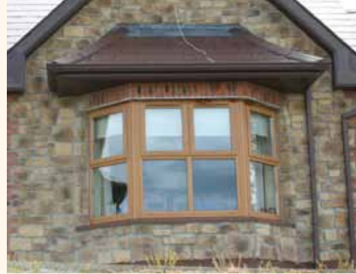
Standard Bay Window