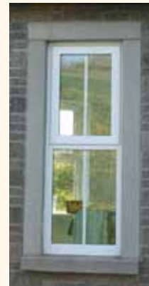
Single 25mm Geo Bar