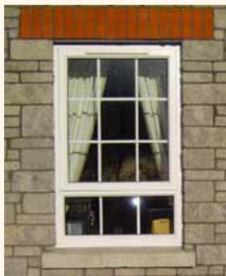
18mm Georgian Bar