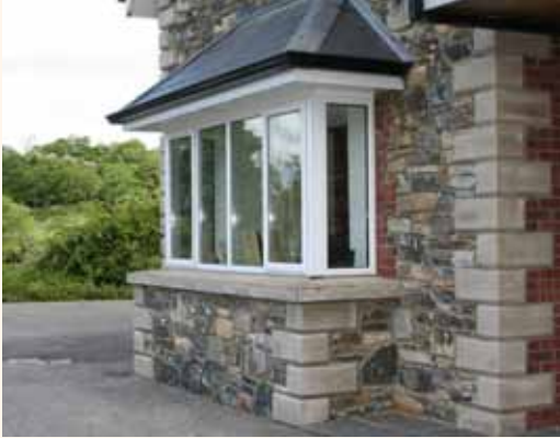
Box Bay Window

Open up your home to your garden and add an extra dimension of light