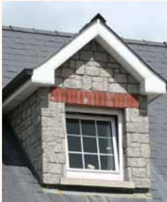
Tilt & Turn

PVC windows will improve the energy efficiency of your entire home. They will lower your fuel bills and can drastically cut the amount of warm air leaving the room.