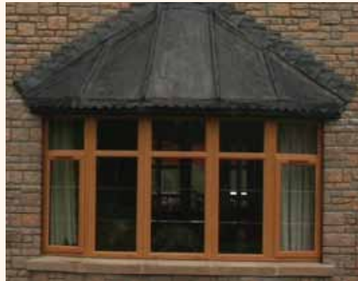
Multi-part Bay Window