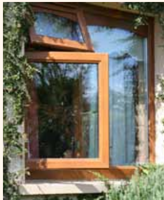
Top Over Sash