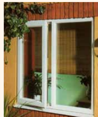
Full Side Opening

Remember... our PVC windows come with a 10 year material and manufacturing guarantee